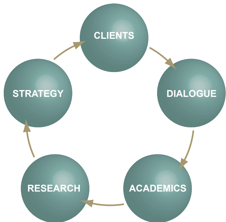
Dimensional’s Academic Feedback Loop

This is a continuous process to which Dimensional commits substantial resources, bringing increasing relevance and new opportunities to the development of science and practice to the ultimate benefit of Dimensional investors.